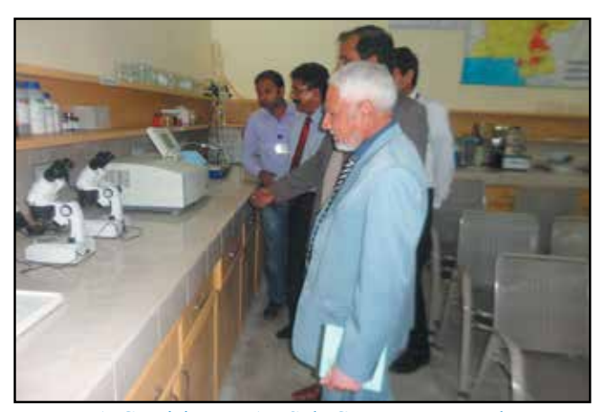
AICs Visit to UAF Sub-Campus, Burewala

57. Serious shortage of faculty in Soil Science is the main constraint in initiating the major classes. Laboratory facilities are satisfactory required for undergrad students. However, class rooms