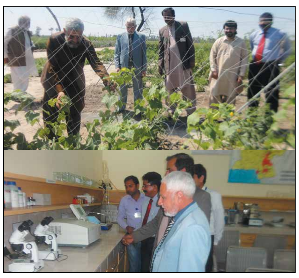
Visit of AICs to UAF Sub Campus, Burewala