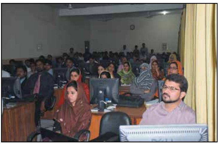
AICs Visit to GCUF Sub-Campus, Layyah

18. The Govt. College University. Faisalabad has established a sub-campus at Layyah through private-public venture in 2012. Food Science degree program was initiated with the inception of the campus. Although, having intake capacity of 50 students, only 25 students were enrolled with present enrollment of 125 students. Currently, only three faculty