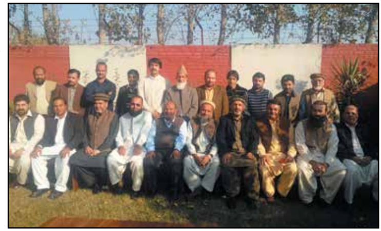
AICs Visit to Bacha Khan University, Charsadda

11. The program evaluators assessed that being newly initiated, the program has poor intake of only three students. It was rated in upper band of Y1 with 63% score i.e. not meeting some of the major accreditation criteria. It has following strength and weaknesses: