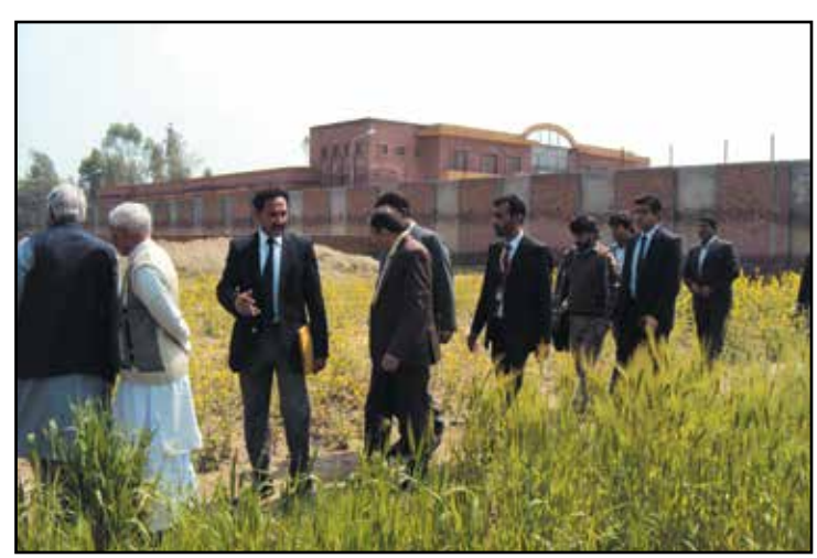
AICs Visit to BZU Bahadar Campus, Layyah

Weaknesses: (i) Shortage of full time regular, senior and experienced faculty; (ii) Laboratory equipment is grossly inadequate to meet the demand of the major subject; and (iii) Faculty offices and class rooms insufficient and ill-equipped.