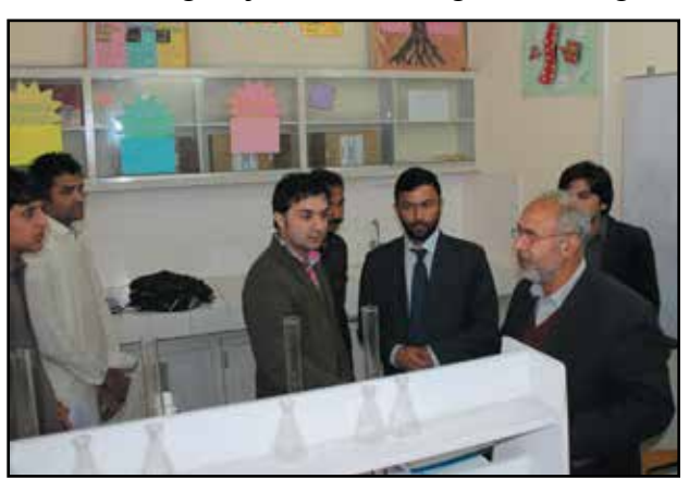
AICs Visit to University of Swabi

Weaknesses: (i) Serious shortage of Ph.D. qualified, senior and experienced faculty; (ii) Absence of Sensory evaluation lab for sensory food analysis experiments, existing labs have limited equipment for students practical; (iii) Lack of IT facilities and limited research and reference material.