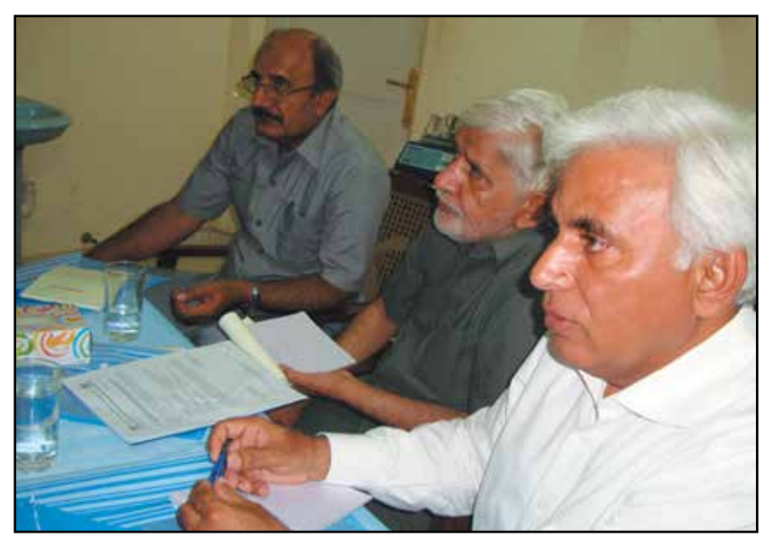
AICs Visit to LUAWMS, Uthal