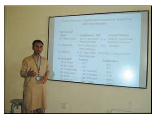
AICs Visit to LUAWMS, Uthal

AIC Recommendations: (i) More Ph.D. teachers be inducted on regular basis; (ii) Newly constructed labs to be functional with needed equipment; (iii) Textbooks, reference material and HEC digital library is required; (iv) Field visits and study tours should be made part of practical; and (v) Improvement of experimental research farm with farm machinery and implements.