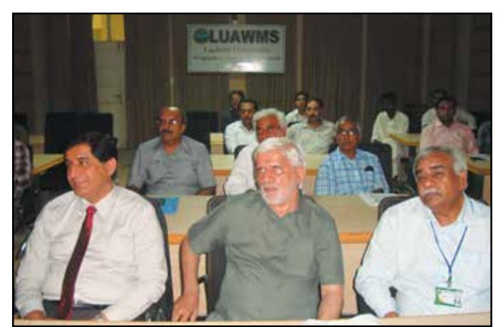
AICs Visit to LUAWMS, Uthal

sound base for practical training of students; (iii) Strengthening and upgrading of IT facilities and other learning resources; (iv) Recruitment of technical and supporting staff based on relevant qualification; and (v) Provision of more faculty offices, class rooms and common room etc.