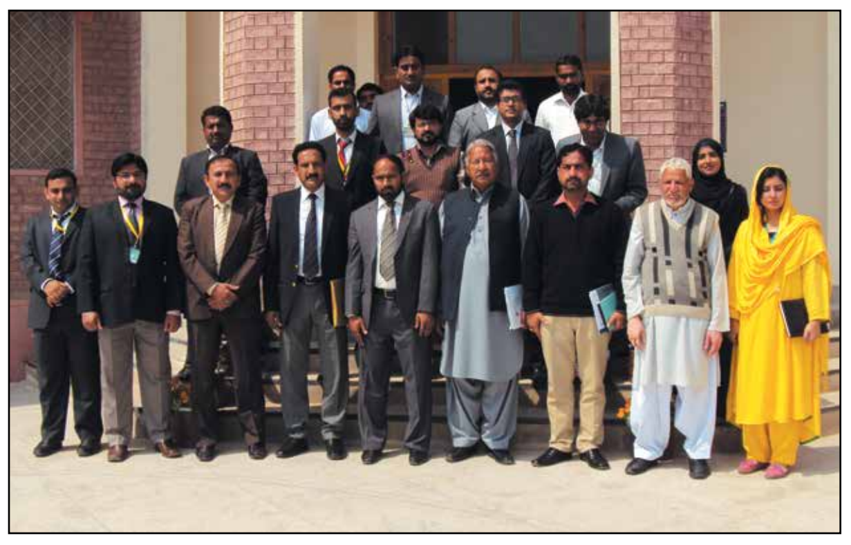
Visit of AIC's to BZU, Bahadar Campus, Layyah