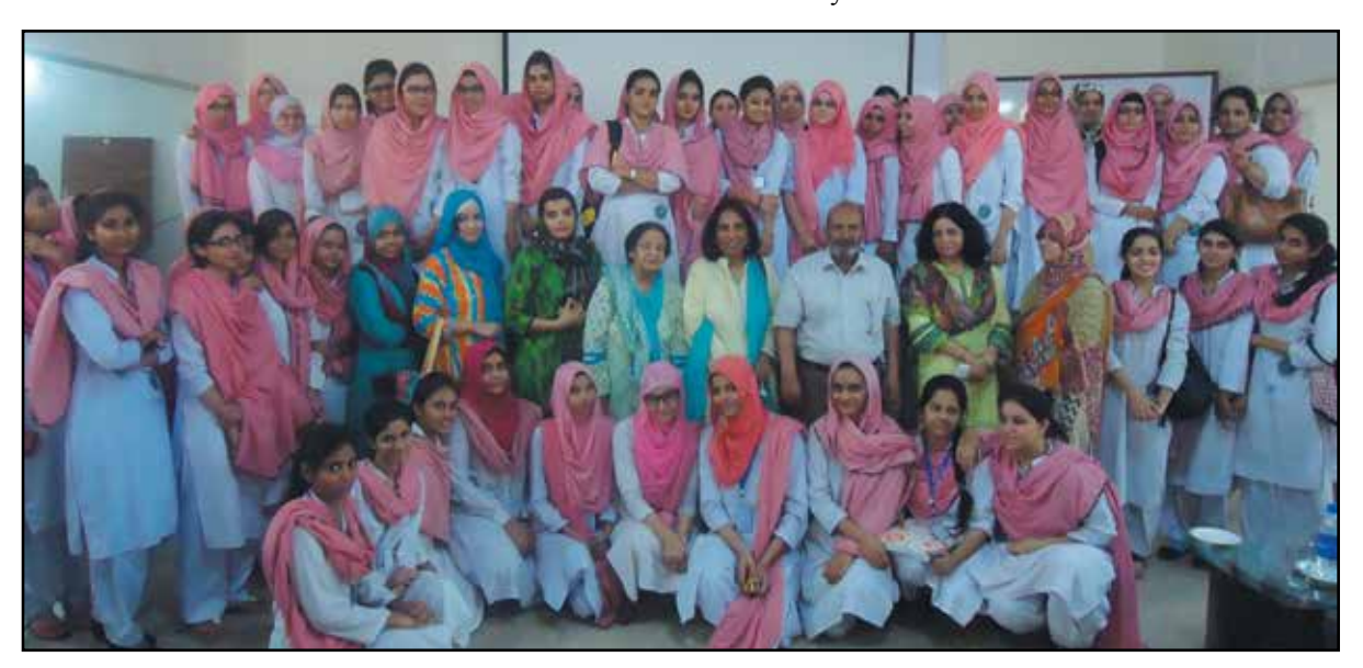
Awareness Seminar at Jinnah University for Women, Karachi