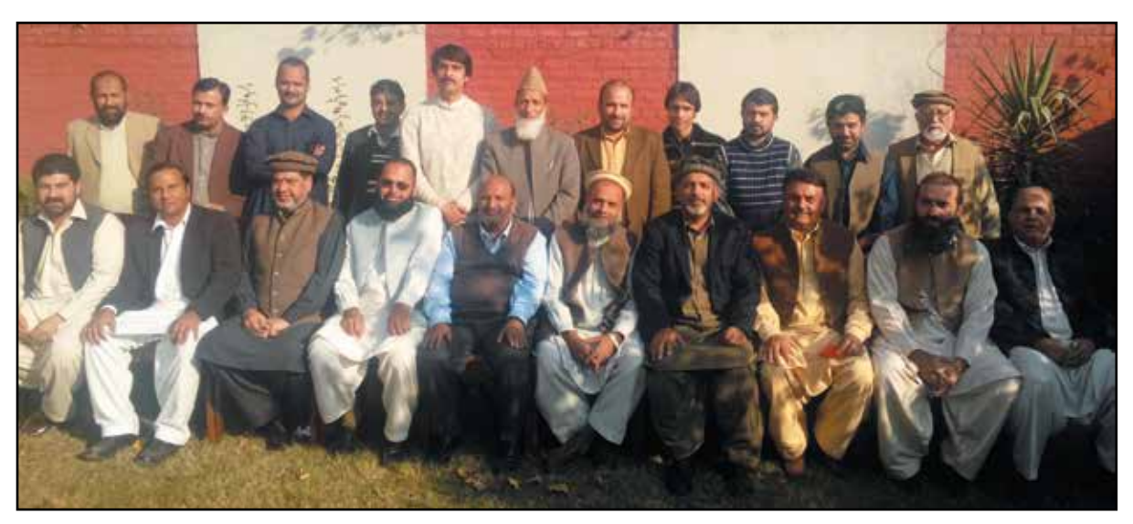
Visit of AICs to Bacha Khan University, Charsadda