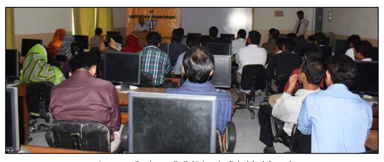
Awareness Seminar at G. C. University Faisalabad, Layyah